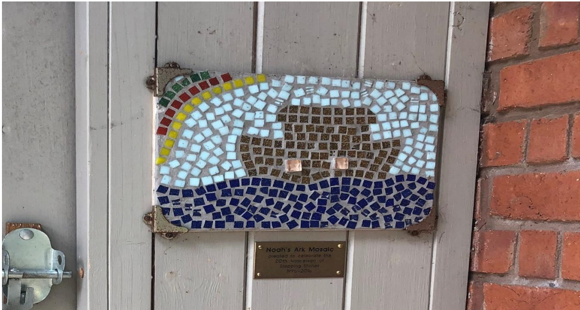
At the entrance to our garden

We have a lovely outdoor space for you to enjoy which we use whenever we can. There are lots of things to do and play with there. Here are some pictures of some of those things. We have lots more!