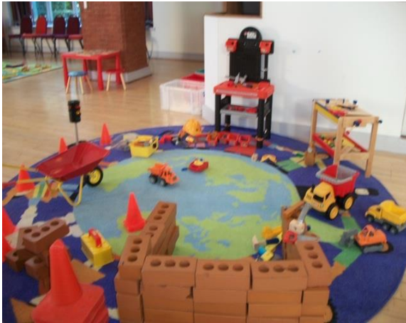
Role play - Construction

There is much more such as singing, dancing, music & movement with ribbons, pompoms and sticks, lots of focused, creative, pre-school activities using open-ended resources! We also do our version of Forest School!